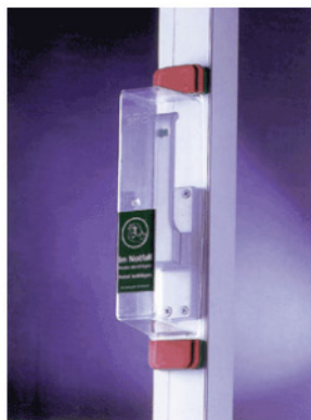
Type D2 & Type E For use on standard or narrow door frames